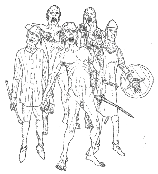
Sheridan McGuire, 2020

HD 1+1, AC 7 [12], strike for 1d6 damage, undead, MV 6/9, XP 30