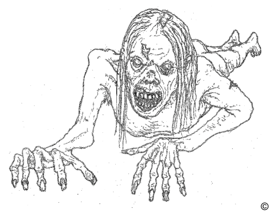
Sheridan McGuire, 2020

HD 3+3, AC 7 [12], touch drains 1 Strength for 90 mins, only harmed by magic weapons weapons, XP 120