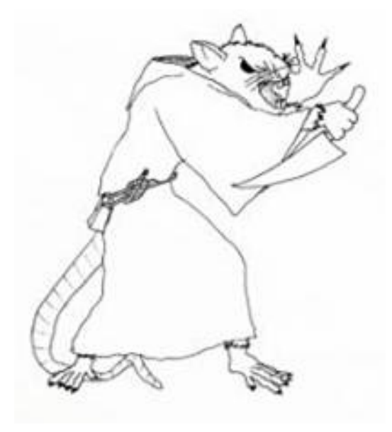
Karl McMichael, 2020

HD 3, 11 Hit Points, AC 6 [13], magic knife for 1d6 or bite for 1d6, needs magic/silver to hit, XP 120.